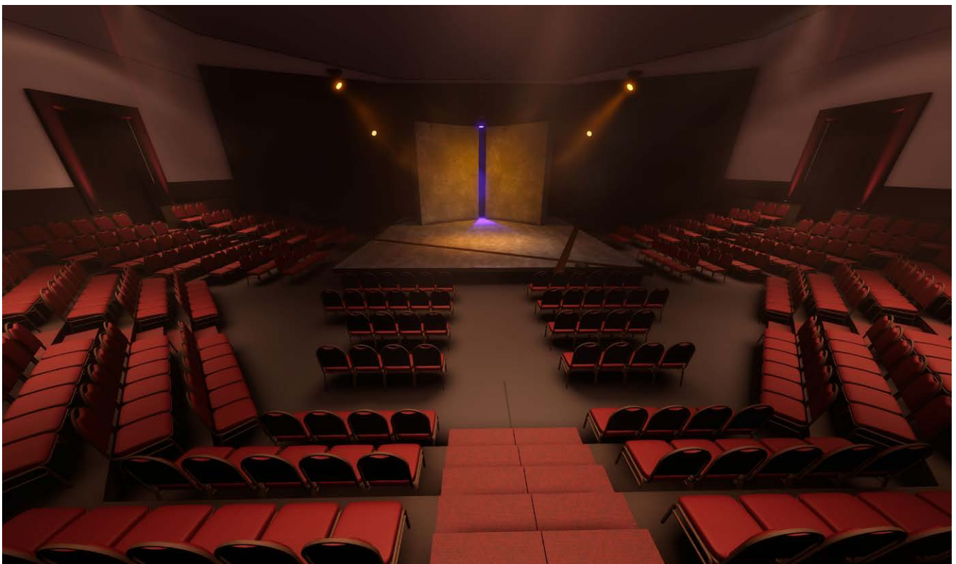
Ashton Hall, Saint Stephens Theatre

This production of 'Hamlet' will launch the 400-seat Ashton Hall at Saint Stephens Edinburgh, a new performance venue in the Scottish capital named after the famous choreographer, the late Sir Frederick Ashton